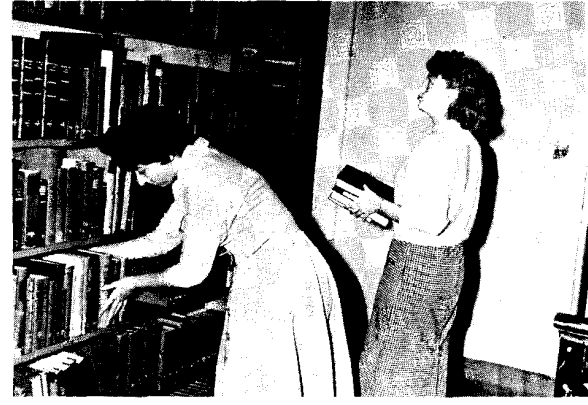
Our library science class maintains order by cataloguing, repairing and shelving new and returned

FIVE THOUSAND copies of printed as you read these words. you a