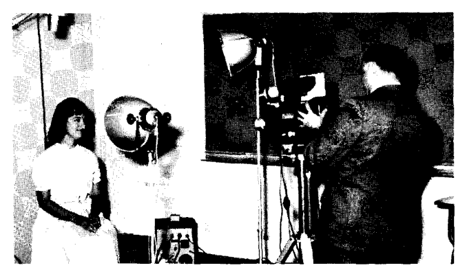
An early step in the production of the 1963 Envoy; the posing and taking of student portraits.